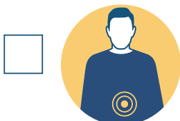
DIARRHEA, NAUSEA OR VOMITING, ABDOMINAL PAIN